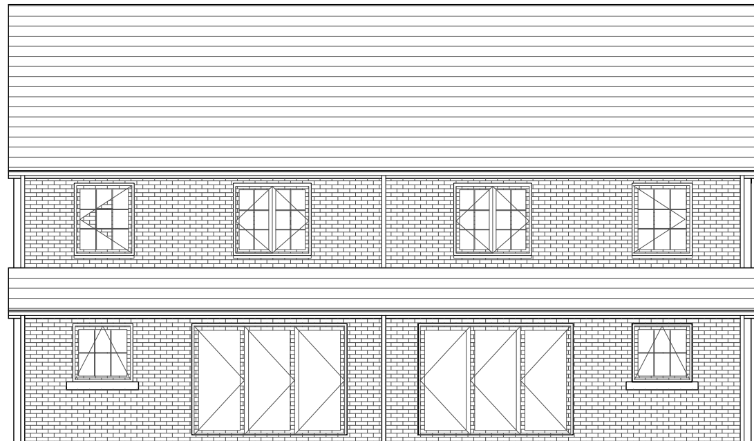
3 | 00 - REAR ELEVATION SCALE 1 : 50