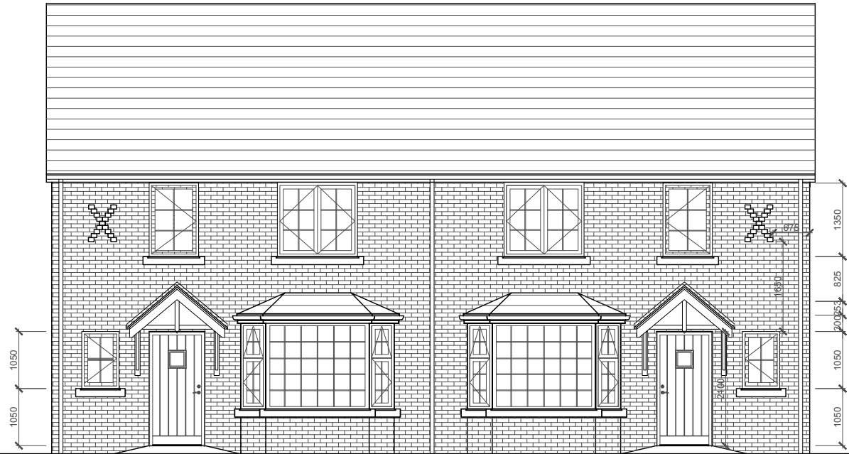
2 | 00 - FRONT ELEVATION SCALE 1 : 50