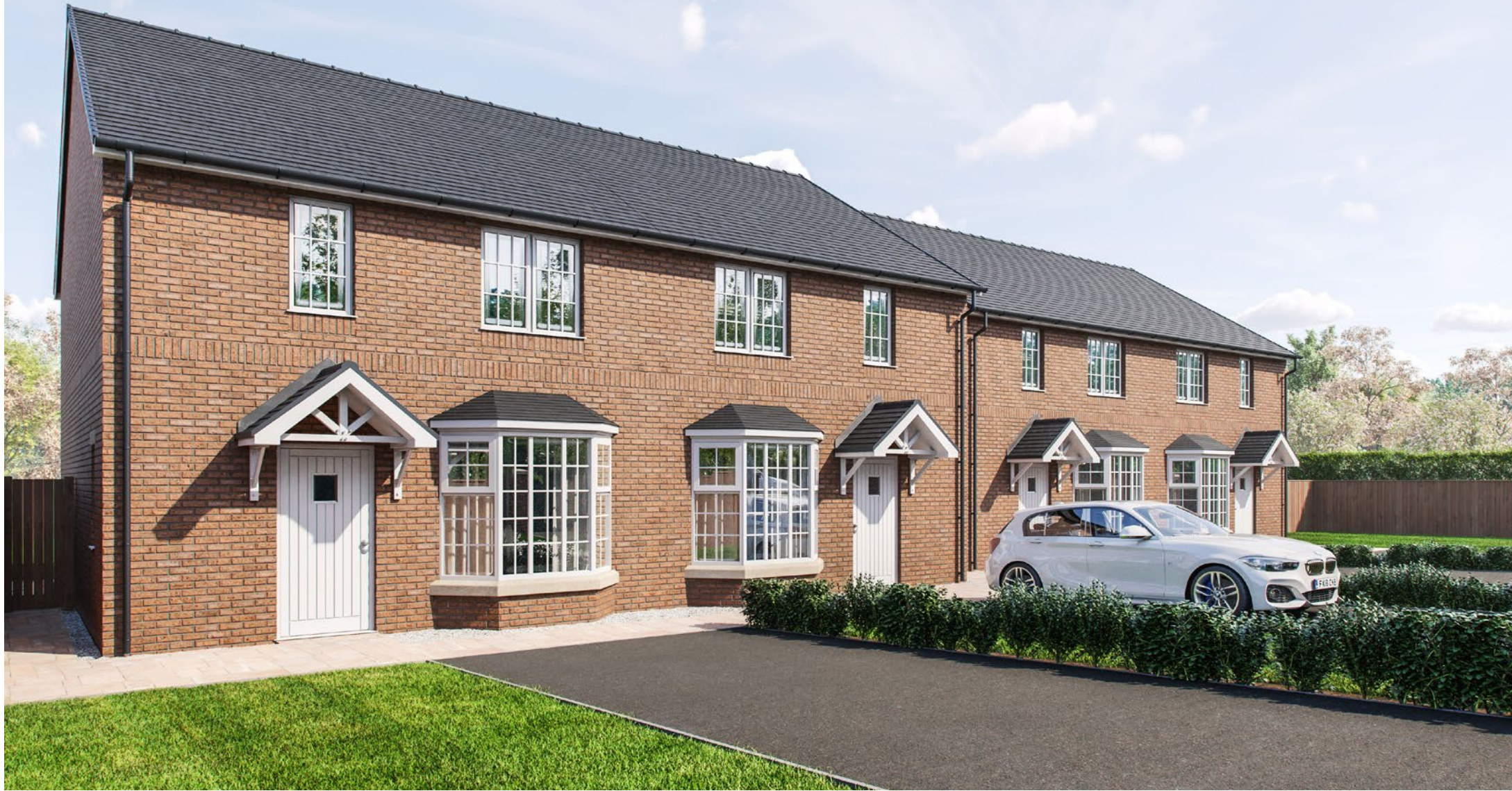
Bachelors Lane CHESTER, CHESHIRE